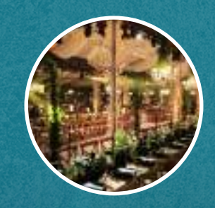
THE GLASS MARQUEE