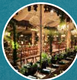
THE GLASS MARQUEE